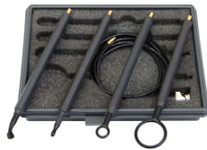
N9311X-100 (Near field probes)

Other calibration options may be available; for more information on calibration go to: www.keysight.com/find/calibration